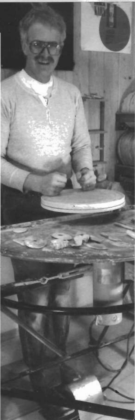
A. Throwing at the standing position, using a modified Soldner professional model wheel. The wheel head is at navel height, which works well for most throwing needs and prevents the tendency to lean forward.