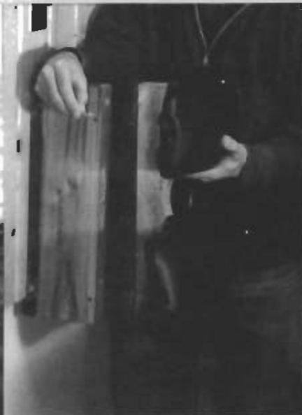
C. The basic mounting of the support pad is accomplished with \frac{1}{4} -in. bolts slipped into place (no nuts required). The 5-in. section of wood can be removed quickly to shift the entire pad structure closer to the wall for making large diameter pots. Lightweight channel iron is used for support framework, lagged to the wall.