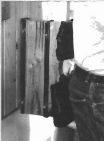
B. The back brace positioned to support the lumbar and buttocks areas. Pads are foam cushions with vinyl coverings.