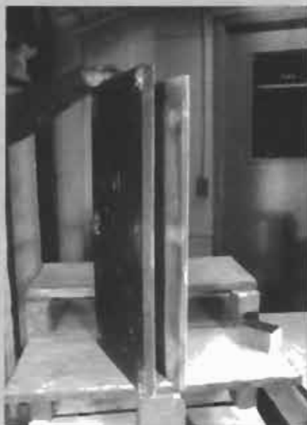
H. A comparison between normal silicon carbide shelving (nearest hand) and newer, Cryston type shelf.