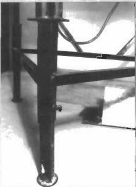
D. Extension to the existing wheel frame using two compatible sizes of light-weight steel tube and 1-in. angle iron.