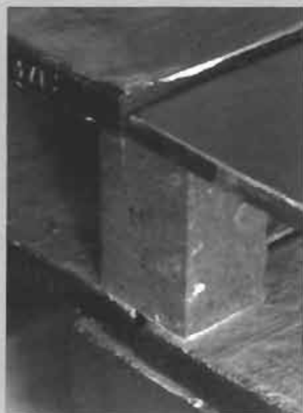
I. Comparison between 1-in. silicon carbide and 3/8-in. Cryston shelving.