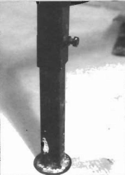
E. Lock bolts on legs for height adjustment.