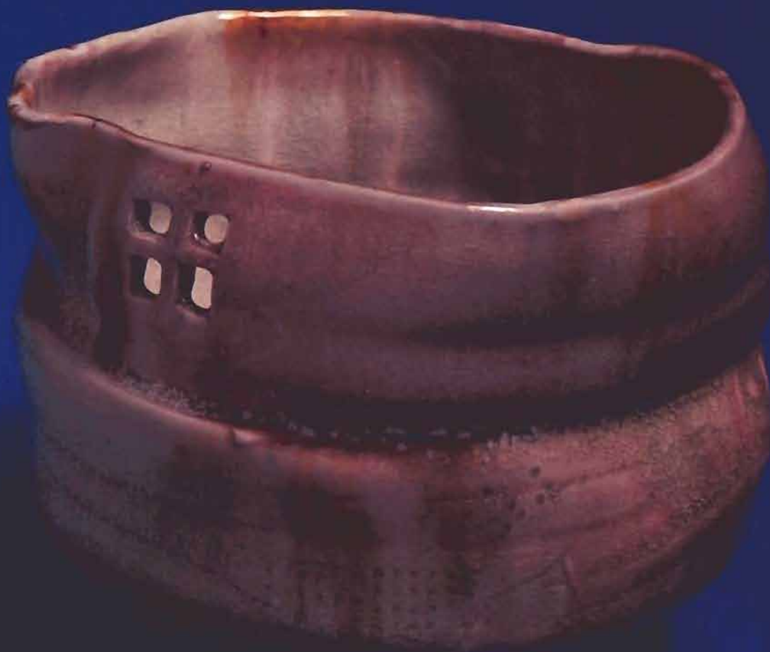
ABOVE Porcelain bowl, 6 1/2 inches in diameter, wheel thrown, excised, soda vapor fired, 1975.