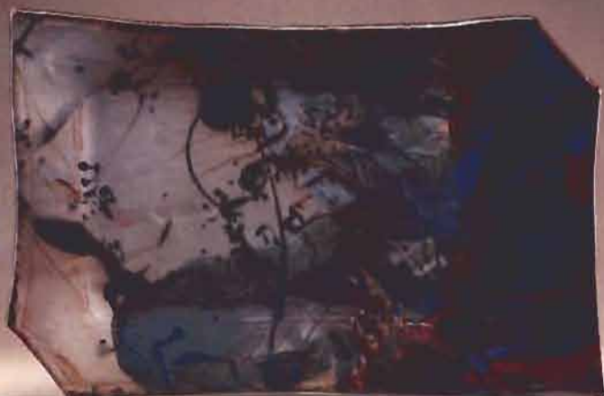
LEFT Tray, 26 inches in length, stoneware, with glazes poured, brushed and trailed in combination with wax resist, Cone 10 reduction fired, 1988, by John Glick.